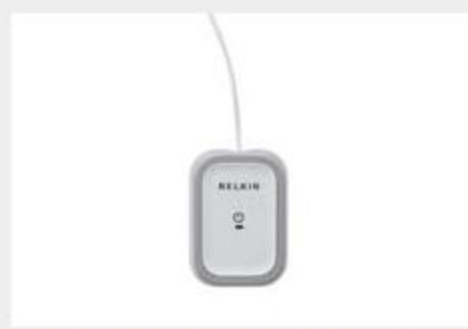
Conserve Surge with Timer Remote Switch Click to download hi-res image