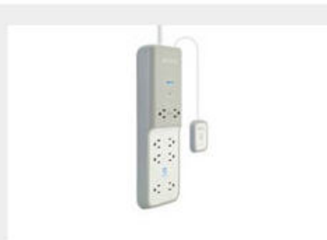
Conserve Surge with Timer Click to download hi-res image

With the new Conserve, employees can plug their office electronics into one of the six "auto off" outlets, while two "always on" outlets keep PCs and other critical devices powered on at all times. Employees can activate the six switched outlets with a single press of the on/off button, allowing the surge protector's automatic timer to eliminate power to those outlets after 11 hours. Prior to the automatic shutdown, a blinking LED on the button will warn employees. When the employee leaves for the day, the switched outlets turn off, eliminating the power consumption that would normally occur throughout the evening and over weekends.