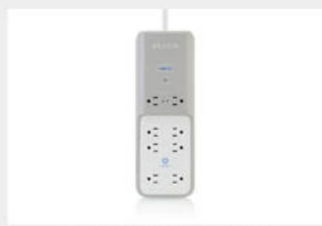
Conserve Surge with Timer Click to download hi-res image